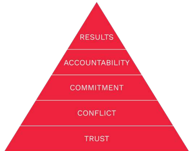
The Five Behaviors model

Since first leading Acelity’s Global Clinical Affairs department through their initial Five Behaviors session, both of the original facilitators have stayed close to the group by continuously checking in, helping the department integrate new members into the team, and conducting follow-up sessions in between. In August 2019, they decided to initiate another Progress Report in order to compare results against the 2018 findings. When the results of the newly-unveiled progress report displayed an all-green triangle (signifying that the department achieved substantial improvement), everyone celebrated.